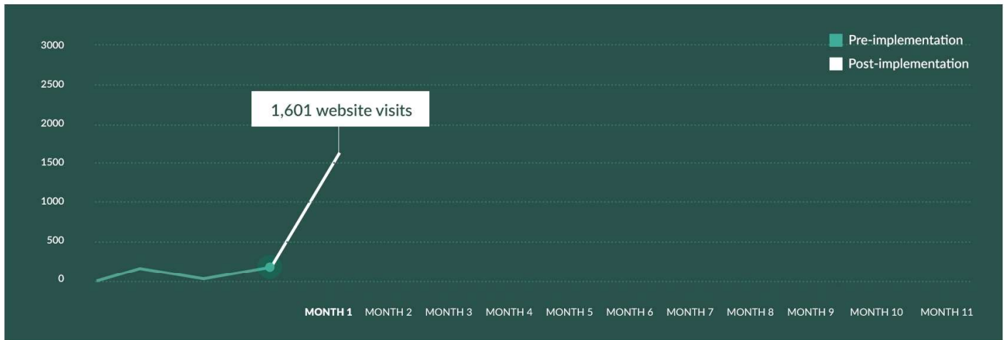
1.3 Image showing visits leading up to the 1,061 for the first month of implementation

Before the campaign, their website was averaged 60 visits each month. By the end of month 1, their website had 1,601 website visits, 26x their previous monthly average.